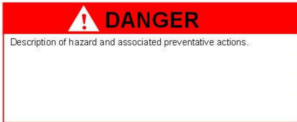
Figure 1: Sample Danger Notice